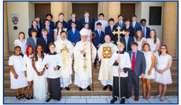
2023 Confirmands Photo