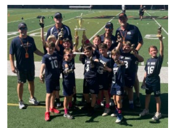
D4 Flag Football Champs 2024