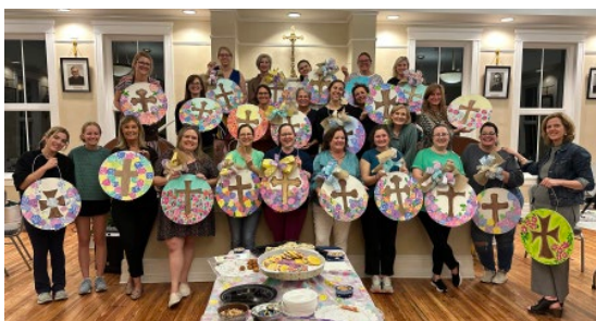
Women of St. Mary Art Class