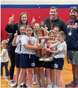
D6 Girls Champs