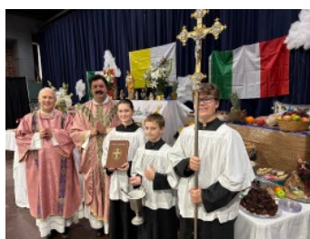
Feast of St. Joseph