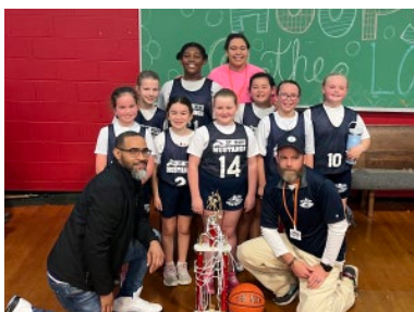
D4 Girls Champs