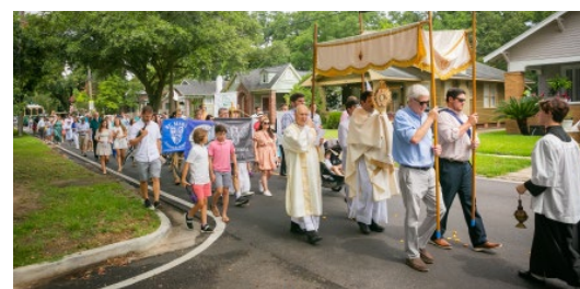
Feast of Corpus Christi