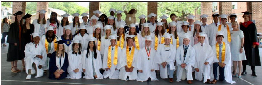
Mustang Walk 2023

St. Mary's welcomed back the 8th grade class of 2019 for the Mustang Walk on May 17. Walking through the hallways of their alma mater, sitting in their old desks, reminiscing with former teachers, and having fun with the St. Mary's students of today made for a complete journey home! We welcome St. Mary's Class of 2020 to our 2024 Mustang Walk on May 15!