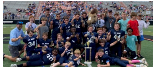
Toy Bowl Football Champs