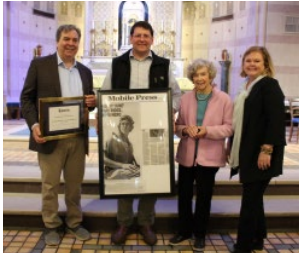
Harry Partridge Alumni Award