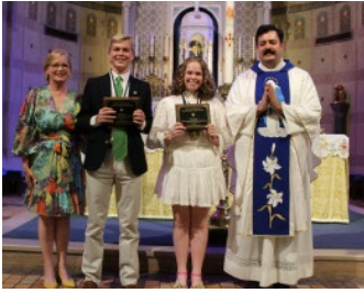
8th Grade Cunningham Recipients