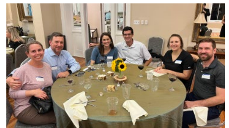
St. Mary Marriage Night 2022