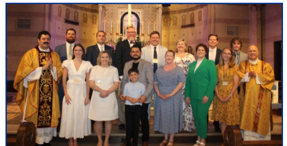
New Catholics 2023