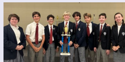
Scholars Bowl Team A-2