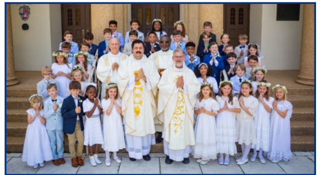
First communicants 2023