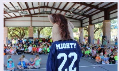
Back of Mighty

Meet "Mighty" the Mustang! Our new Mustang Mascot was introduced this September during our Grandparent's Day and Pavilion Reveal celebration. After a school wide contest, St. Mary students chose the name of our fearless and Mighty Mustang announced at this year's Toy Bowl Pep Rally! #22 will always mark the year Mighty was named!