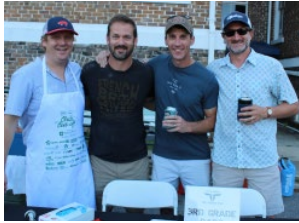
Third Grade Dads Steak Out