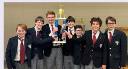
Scholars Bowl Team B