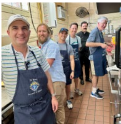
Fish Fryers 2023