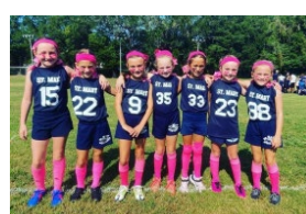
All Girls Flag Football Team